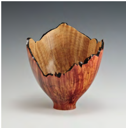
Glenn Ashley Sunset Bowl , 2010 Maple Burl 5 x 5 x 5.5 in.