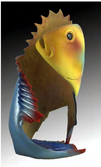
Marty Kaminsky Something Fishy , 2011 Wood 4 x 4 x 8 in. Courtesy of the Artist