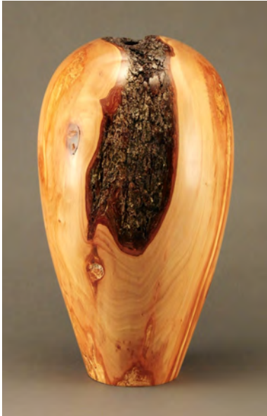
Ed Peine Eureka , 2016 Spalted Box Elder 8 x 8 x 13 in. Courtesy of the Artist