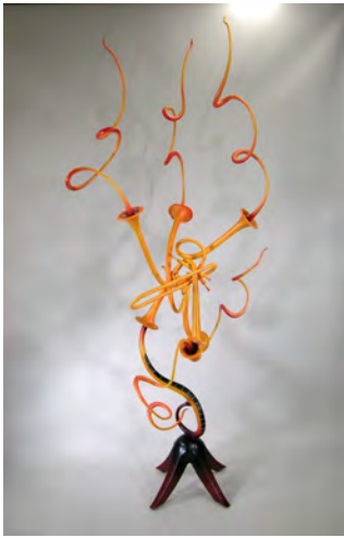
Jerry Bennett Opening Act , YYYY Yellowheart, mahogany, steel, brass 48 x 42 x 120 in.