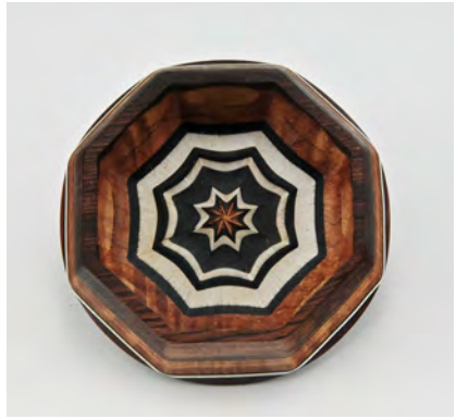
Rich Steber Rose Engine 23 , YYYY Layered wood, veneer, laminated plastic 4 x 4 x 1.75 in.