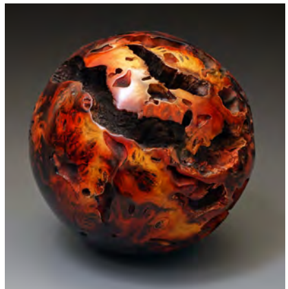
Ric Taylor Earth on Fire , 2014 Buckeye Burl 5 in. sphere