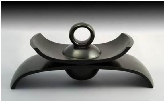
Bill Pottorf Asian Box , 2009 Ebonized Sycamore, Pecan Ring 12 x 4 x 6 in.