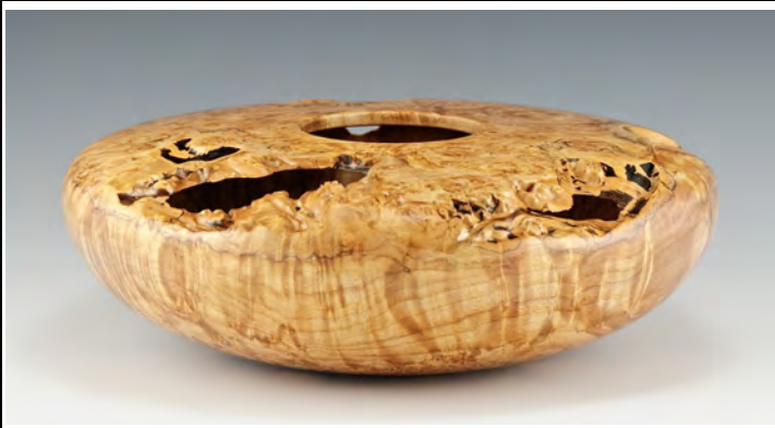
Andrew C. Chen Nature's Beauty , 2016 Bigleaf Maple 10 x 10 x 3.5 in. Courtesy of the Artist