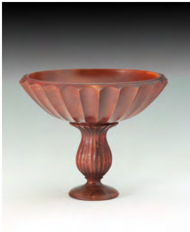
Bill Pottorf Pedestal Dish , 2011 Elm, Red Pecan 8 x 8 x 7 in.