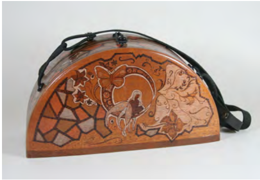
Janice Levi Half Moon Fairy Purse , 2015 Mahogany, Pyrography, Colored Pencil 10 x 5 x 3.5 in.