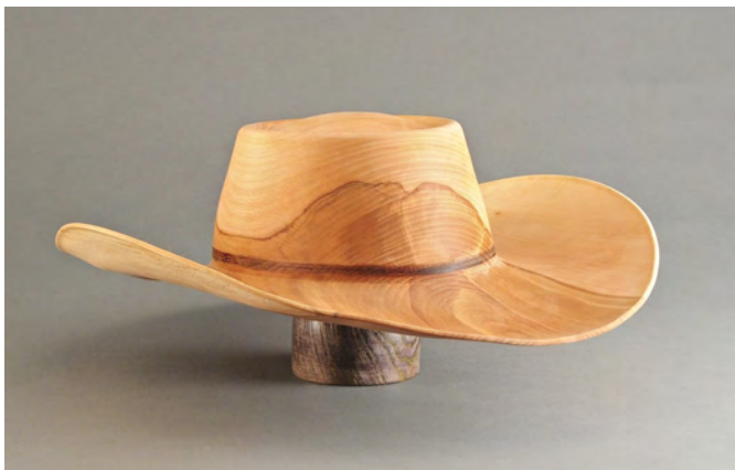
Dennis Ford Beech Hat , 2016 Beech 17 x 15 x 5 in.