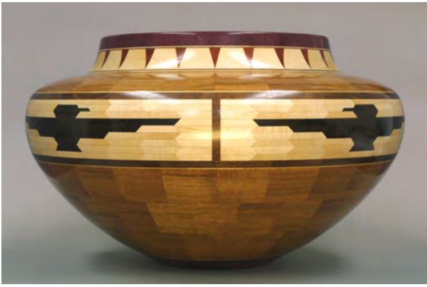
Andrew C. Chen Soaring , 2005 Purpleheart, Maple, Walnut, Bloodwood, Brazilian Cherry, Zircote 14 x 14 x 9 in. Courtesy of the Artist