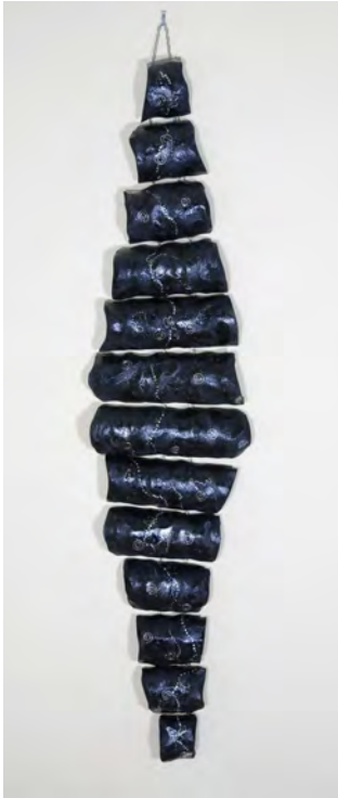
Paula Haymond Folding Space , YYYY Maple 13 x 2.5 x 53 in. Courtesy of the Artist