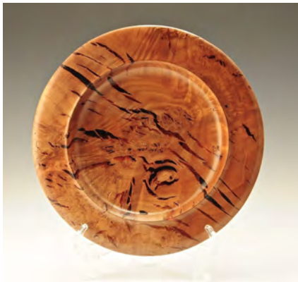
Glenn Ashley Stained Glass Platter , 2010 Madrone 11 x 11 x 2 in.