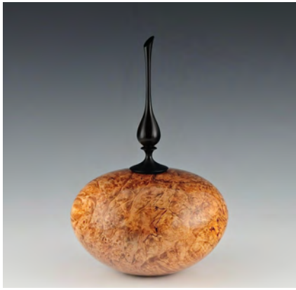
Paul Millo Maple Burl Hollow Form with Dyed Maple Finial, YYYY Maple 5 x 5 x 9 in.