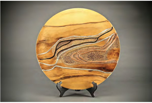
Paula Haymond Sweet Landscape , YYYY Sweet Gum 20 x 20 in.