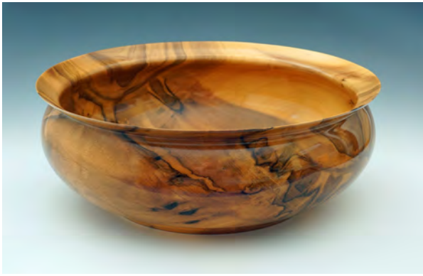
Ric Taylor Magnolia Bowl , 2013 Magnolia 13 x 13 x 5 in.