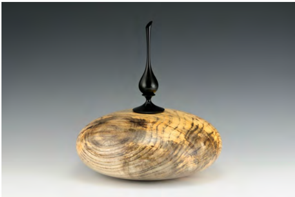
Paul Millo Spalted Hackberry Hollow Form with Maple Dyed Finial, YYYY Spalted Hackberry, Maple 8 x 8 x 9 in.