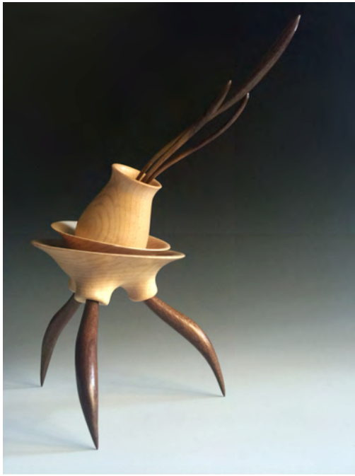
Rebecca DeGroot Reach , 2016 Maple, Walnut 10 x 5 x 9.5 in.