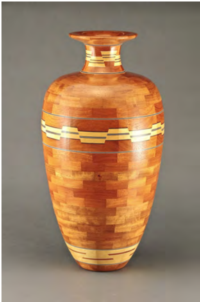
Pete Copeland Normal and Reverse , 2016 Jatoba, Yellowheart 10 x 10 x 19.5 in.