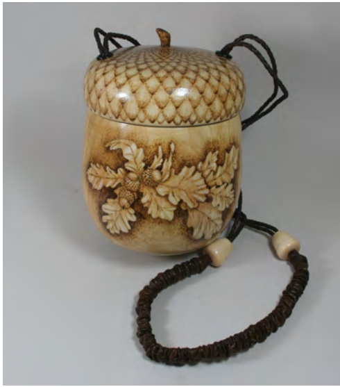
Janice Levi Acorn Purse , 2016 Ash, Pyrography 5.5 x 5.5 x 7 in.