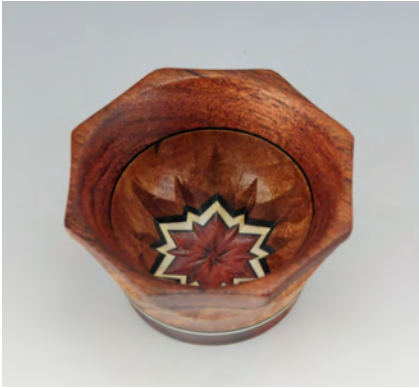
Rich Steber Rose Engine 32 , YYYY Layered wood, veneer, laminated plastic 2.5 x 2.5 x 1.5 in.