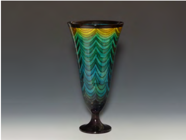
Kendall Westbrook Blue Goblet , 2009 Plywood, Cocobolo 4.25 x 4.25 x 8.25 in. Courtesy of the Artist