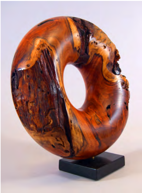
Jim Keller Sergio , 2013 Mesquite 15 x 15 x 8 in.