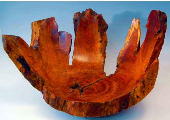
Jim Keller Hand , 2000 Mesquite 24 x 24 x 15 in.