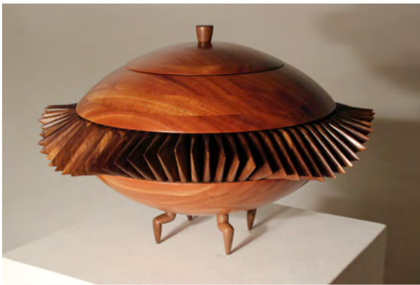
Rebecca DeGroot Refuge , 2012 Mahogany, Walnut 21 x 21 x 13 in.