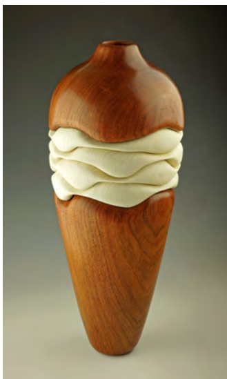
Ric Taylor New Direction , 2015 Mesquite 5 x 5 x 15 in. Courtesy of the Artist