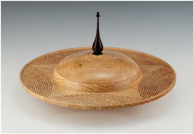
Dennis Ford UFO , 2015 Big Leaf Maple 11 x 11 x 6 in.