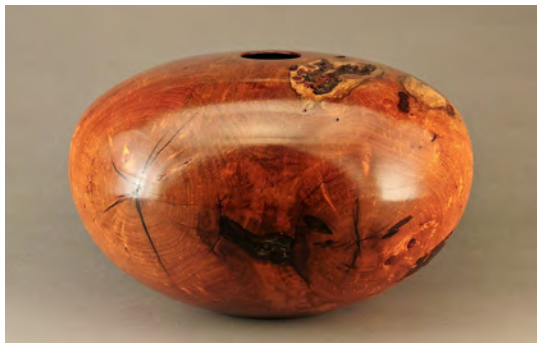
Ed Peine Time, 2015 Mesquite Burl Crotch 17 x 17 x 10 in.