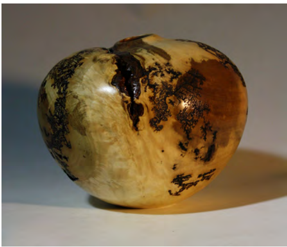
Dennis Ford Heart of the Forest , 2016 Chinese Tallow 9 x 9 x 8 in. Courtesy of the Artist