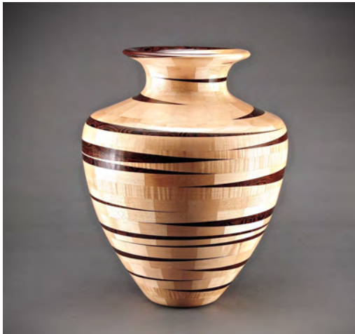
Pete Copeland Tiger Smiles , 2015 Maple, Wenge 13.5 x 13.5 x 17 in.