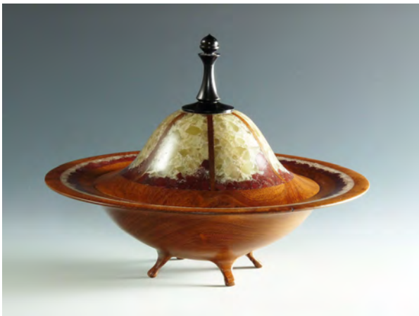
Kendall Westbrook Cathedral Arches , 2007 Mesquite, alabaster, ebony 7.25 x 7.25 x 5.25 in.