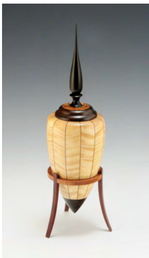
Andrew C. Chen To the Point , 2016 African Blackwood, Texas Mountain Laurel, Zircote, Maple, Walnut Veneer, East Indian Rosewood, Afzalia, Pernambuco 3.25 x 3.25 x 10.25 in.