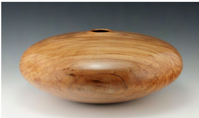
Paul Millo Large Elm Hollow Form , YYYY Elm 14 x 14 x 6 in. Courtesy of the Artist