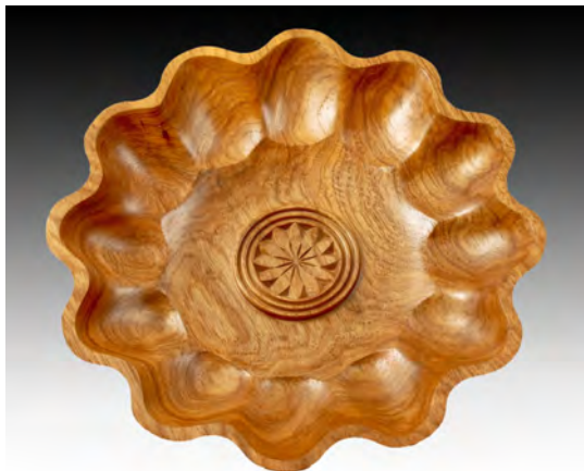
Bill Pottorf Dodecassette Deviled Egg Platter , 2008 Water Hickory (Red Pecan) 12 x 12 x 2 in.