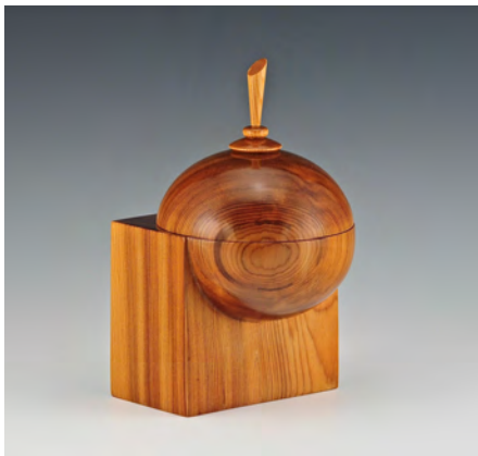
Paul Millo Fence Post Cedar Box , YYYY Cedar 3.5 x 3.5 x 6 in. Courtesy of the Artist