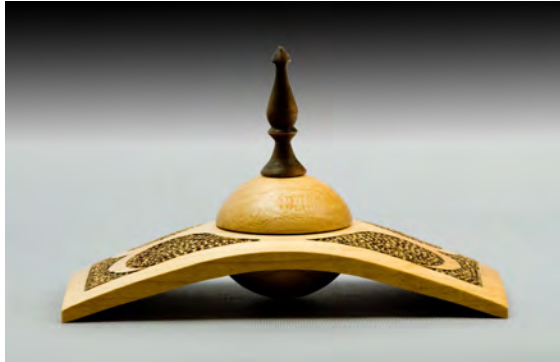
Bill Pottorf Wing Box , 2009 Maple, Walnut 2.5 x 5 x 3 in. Courtesy of the Artist