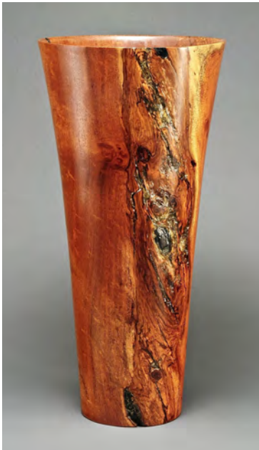
Ed Peine The Rose , 2009 Mesquite 7 x 7 x 15 in.