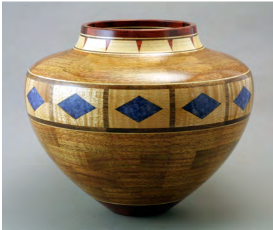
Andrew C. Chen Die Ersten Nach den Letzten (The First After the Last) , 2014 Bloodwood, Maple, Walnut, Mesquite woods. Red coral, Lapis lazuli 8 x 8 x 7.5 in.