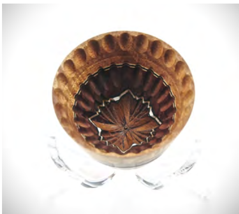
Rich Steber Rose Engine 7 , YYYY Layered wood, veneer, laminated plastic 2.25 x 2.25 x 1.5 in.