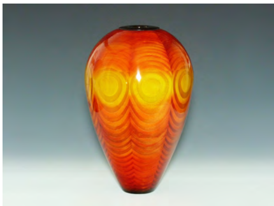
Kendall Westbrook Under the Noon Day Sun , 2010 Plywood, Cocobolo 6 x 6 x 9.25 in.